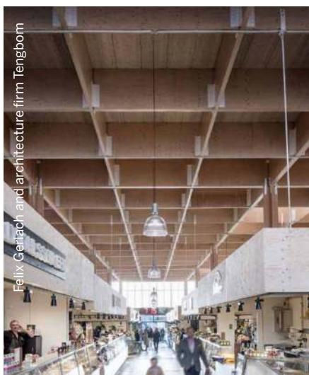
Östermalm market, Sweden Temporary market hall

For more inspiration, visit www.metsawood.com/references