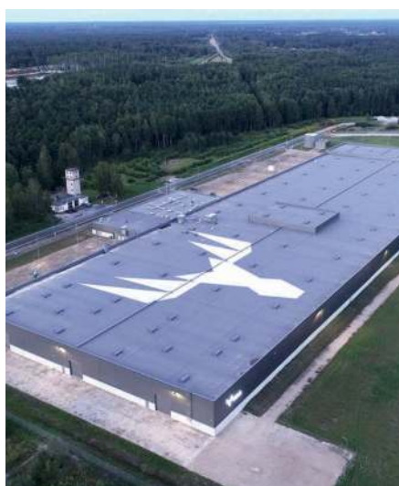
Metsä Wood Pärnu mill, Estonia Fast construction with wooden roof elements