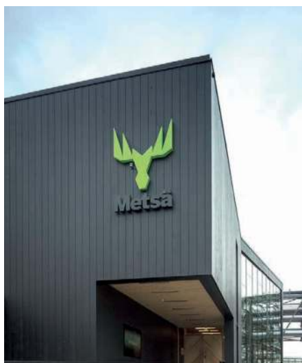
Pro Nemus, Finland Metsä Group's visitor centre, a showcase of engineered wood