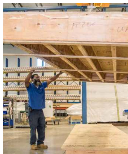
Blueprint Robotics, USA Prefabricated wooden elements