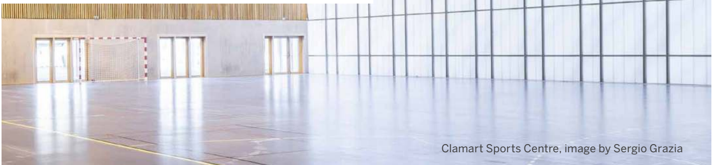
Clamart Sports Centre

Kerto® LVL (laminated veneer lumber) is an engineered wood product used in all types of construction projects, from new buildings to renovation and repair. Kerto LVL is strong, lightweight and dimensionally stable. It does not warp or twist.