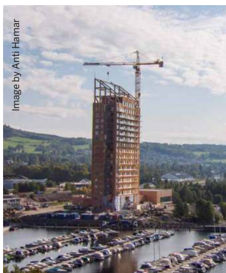
Mjøstårnet, Norway The world's tallest wood building

Use of Kerto LVL makes construction FAST, LIGHT and GREEN.